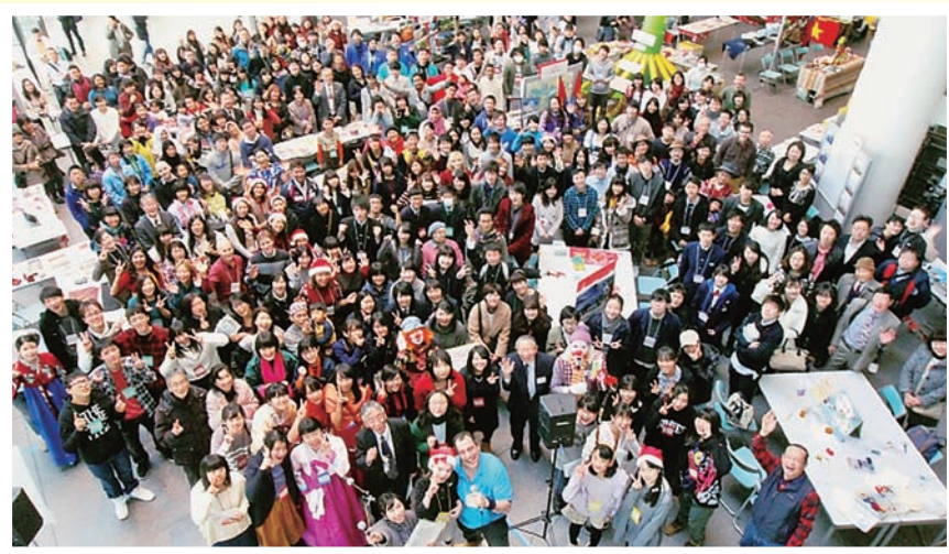
Last year's One World Festa