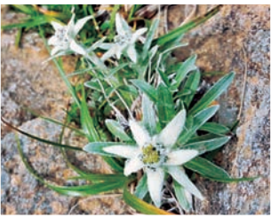
Edelweiss on Hayachine

Hiking is one of my favourite Iwate hobbies. Since moving here I have climbed a lot of Iwate's mountains, including Hachimantai, Goyo, Himekami, Hikami, Rokkoushi, Azumane, and of course Mount Iwate, among many others. My favourite mountain in Iwate (no, in Japan, no, in the world!) is Mount Hayachine. It is the first real mountain that I ever climbed- now I've climbed it 5 times. (Wow, even I can't believe it!) I heard that Kawaranobou Trail is not passable anymore, but I still recommend you to try climbing Odagoe Trail. Both are beautiful, especially in June when all the flowers are blooming. Hayachine Usu Yuki So, a type of white edelweiss, is particularly famous because it only grows on Mount Hayachine.